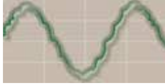
12-Pulse drives typically produce a rough sinusoidal waveform.