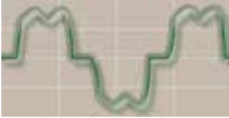
6-Pulse drives typically have distortion with steep current rises.