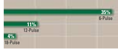
18-pulse drives exceed the IEEE standard of 5% THD. The chart illustrates differences between 6-, 12- and 18-Pulse solutions. For sensitive medical and electronic equipment, Eaton's CPX9000 is unsurpassed.